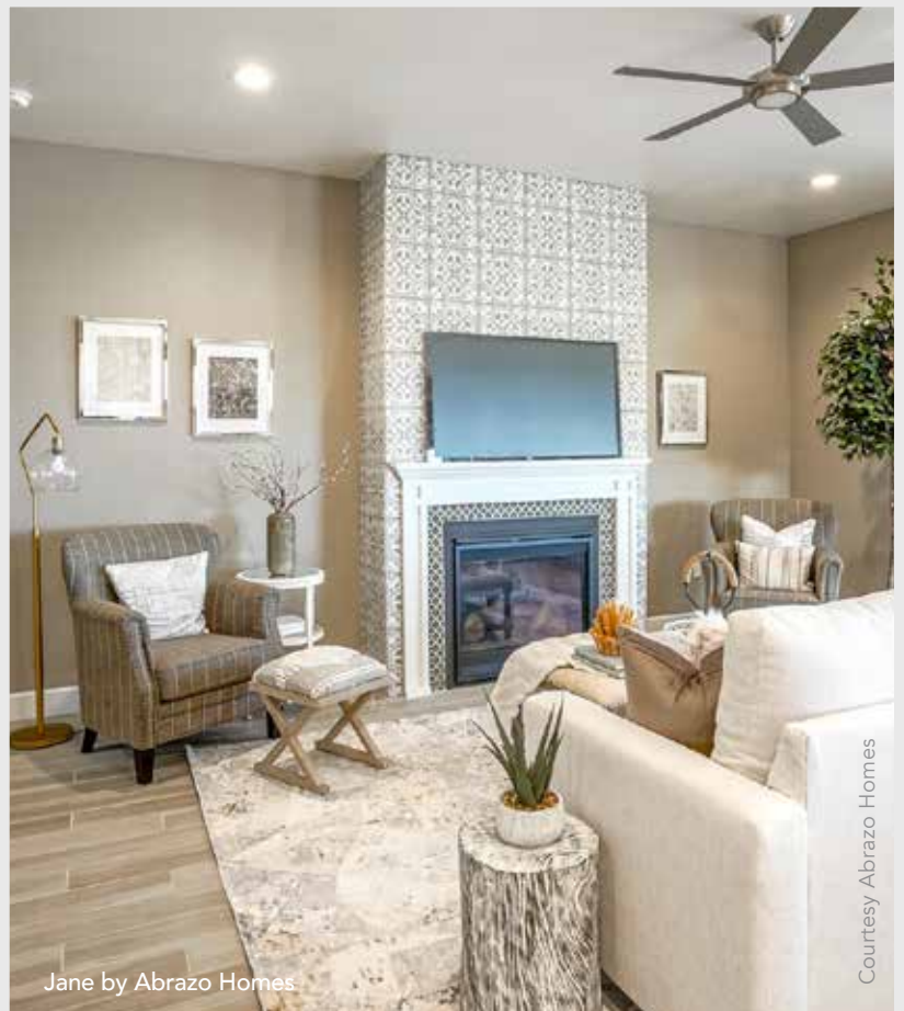
Jane by Abrazo Homes

Richmond American Homes, richmondamerican.com