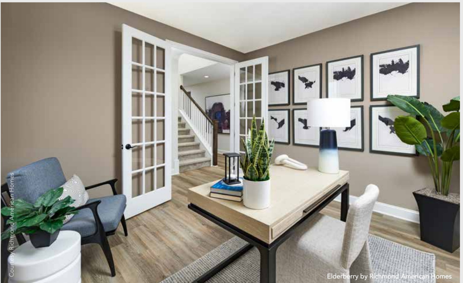
Elderberry by Richmond American Homes

Despite the community's intimate size, Scottish Isle boasts a well-designed layout that promotes an open, community-focused atmosphere. The neighborhood includes ample open spaces and an abundance of