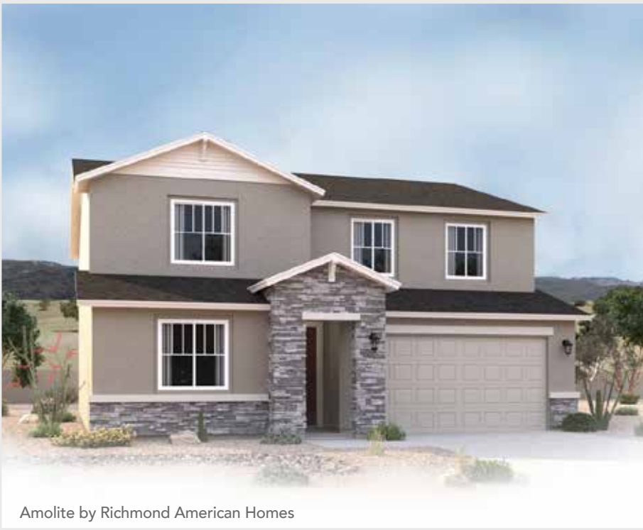
Amolite by Richmond American Homes

floor plans in this community ranging from a cozy 1,700-square-foot single-story home to a spacious 3,000-square-foot two-story design, including a mix of three to five bedrooms and up to three-and-a-half bathrooms, allowing for flexible configurations such as additional guest suites or loft conversions to accommodate growing families.